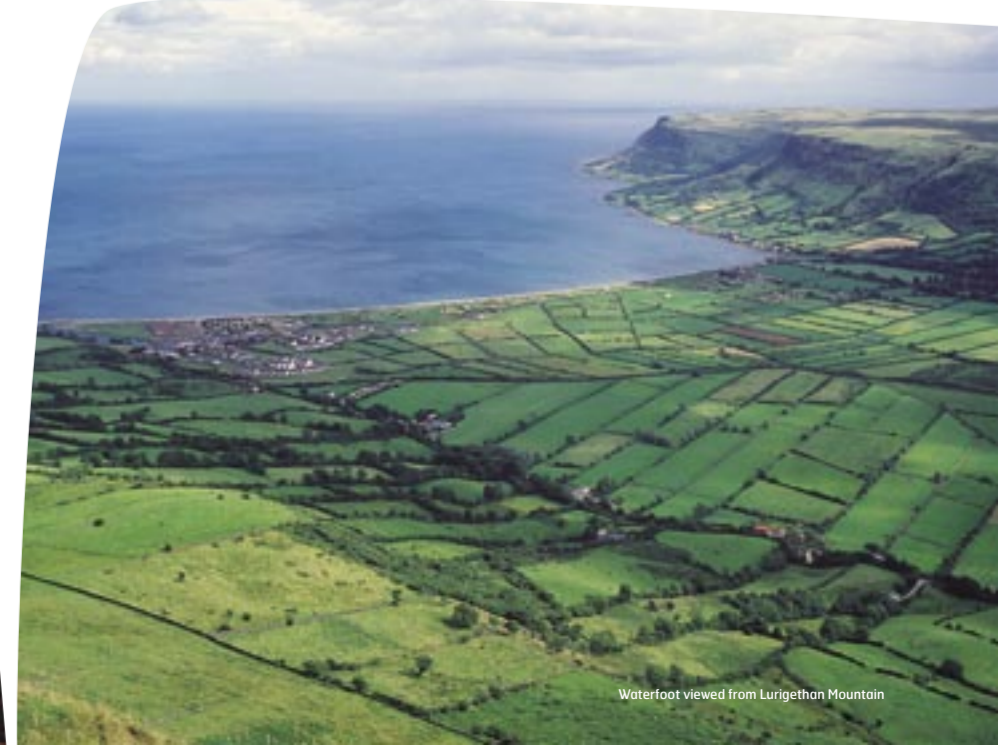
Waterfoot viewed from Lurigethan Mountain